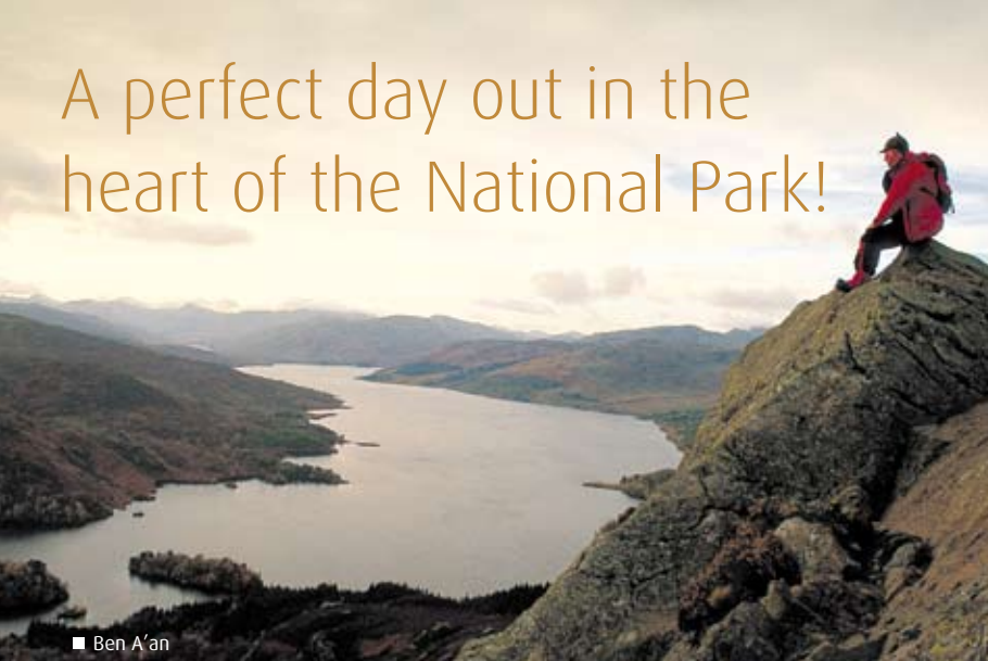
■ Ben A'an

The Trossachs Trundler summer bus service allows you to relax and explore the Trossachs without your car. It links the gateway resorts of Callander and Aberfoyle and takes in some breathtaking scenery and popular attractions in the stunning Loch Lomond and The Trossachs National Park.