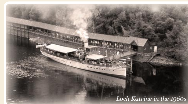
Loch Katrine in the 1960s

Check out www.lochkatrine.com for dates and further information.